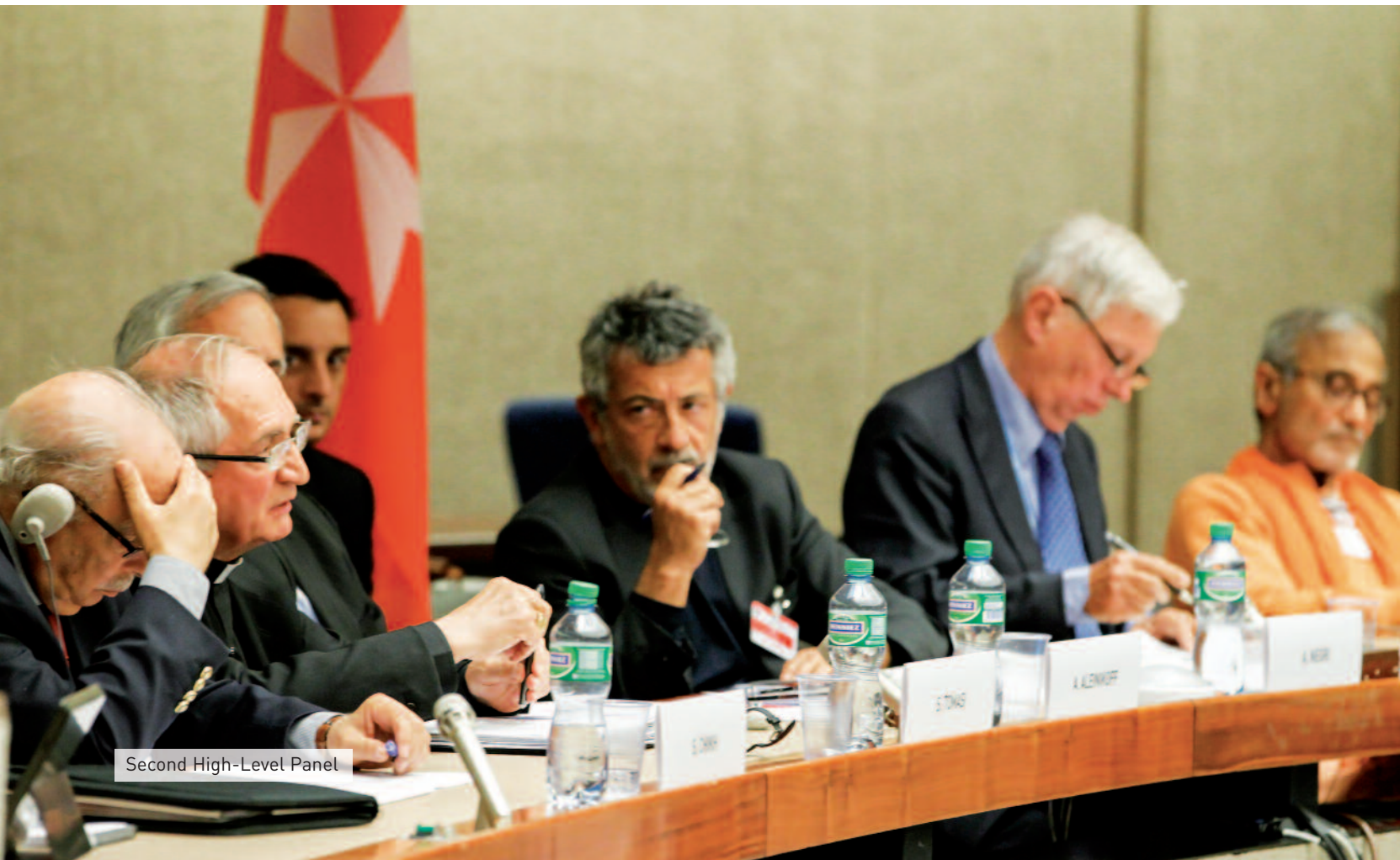
Second High-Level Panel