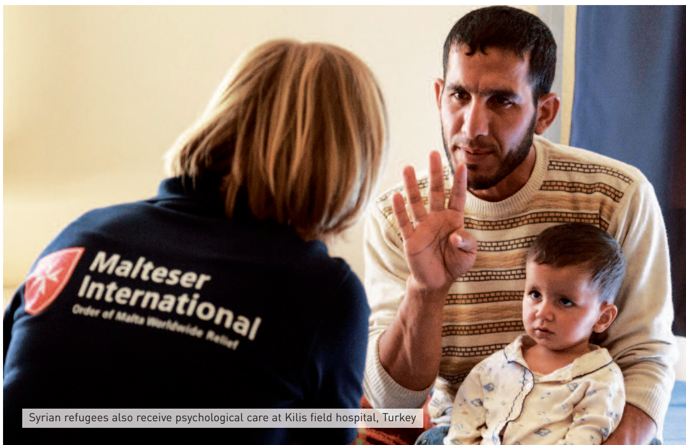
Syrian refugees also receive psychological care at Kilis field hospital, Turkey

to convert as a pre-condition for support; or when they stigmatise and discriminate against individuals or groups of people. The inappropriate behaviour of just one faith actor can discredit us all. Therefore we must do everything we can to lead by example and to demonstrate that faith-based action does not undermine the principles of impartiality and neutrality.