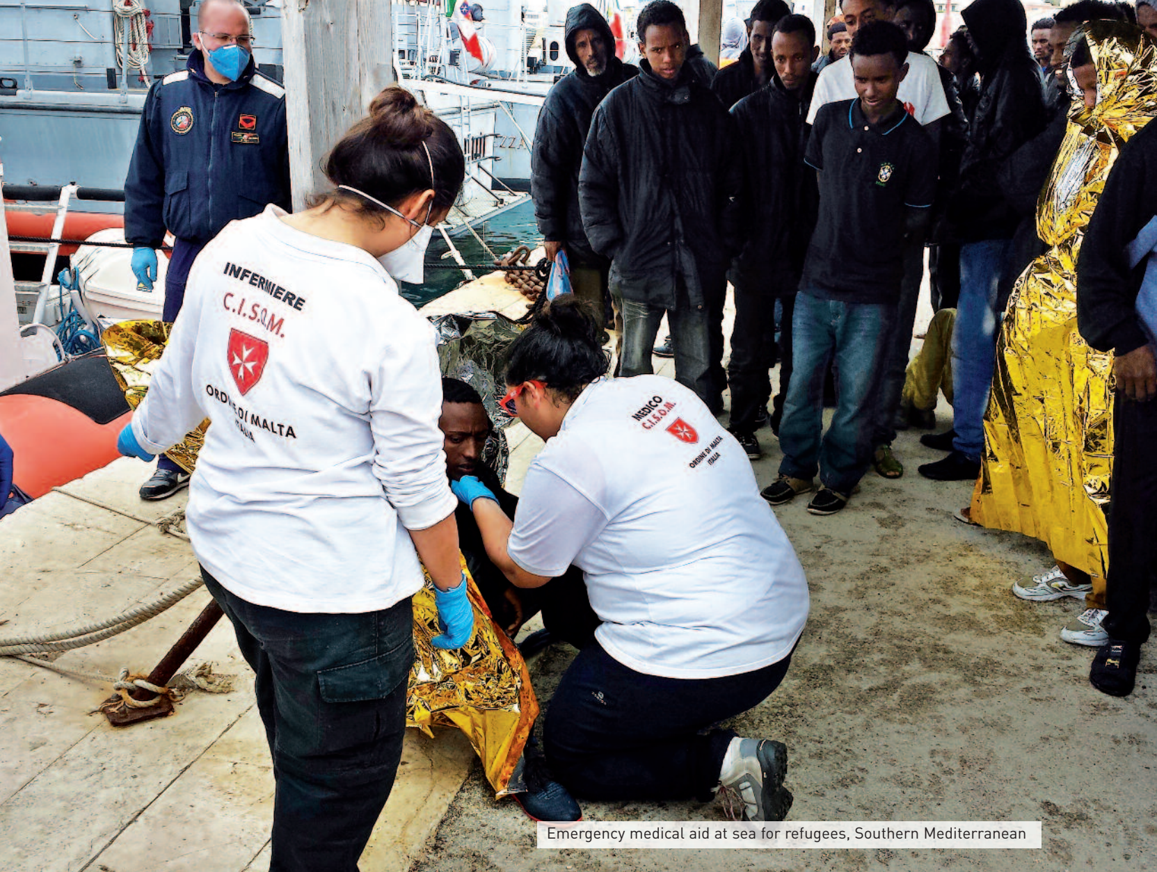
Emergency medical aid at sea for refugees, Southern Mediterranean