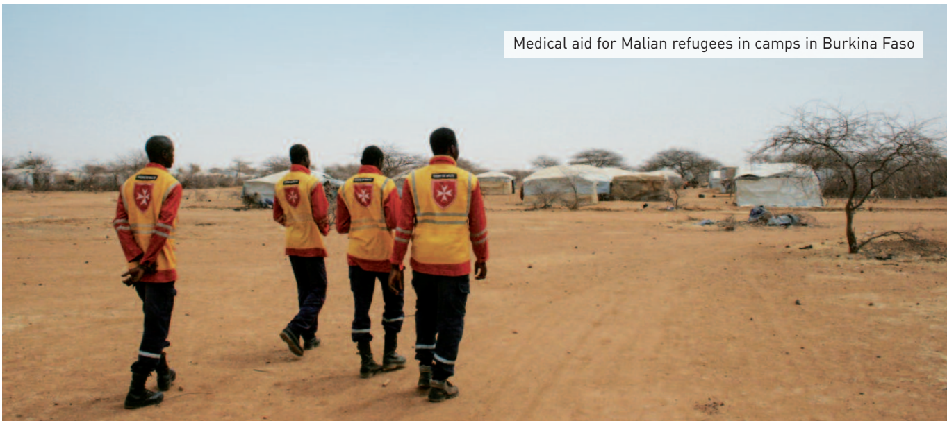
Medical aid for Malian refugees in camps in Burkina Faso

To contribute and support this initiative, we are here today to explore how faith-based institutions and humanitarian actors