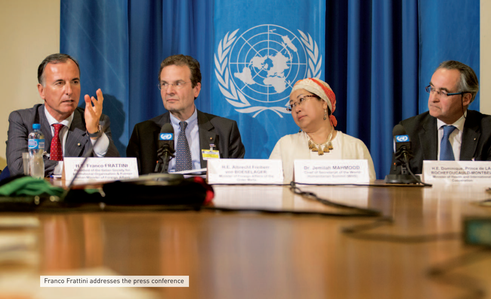
Franco Frattini addresses the press conference