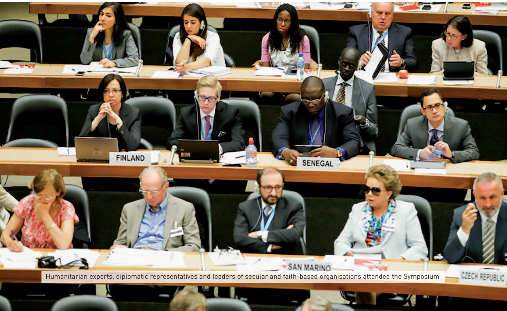
Humanitarian experts, diplomatic representatives and leaders of secular and faith-based organisations attended the Symposium