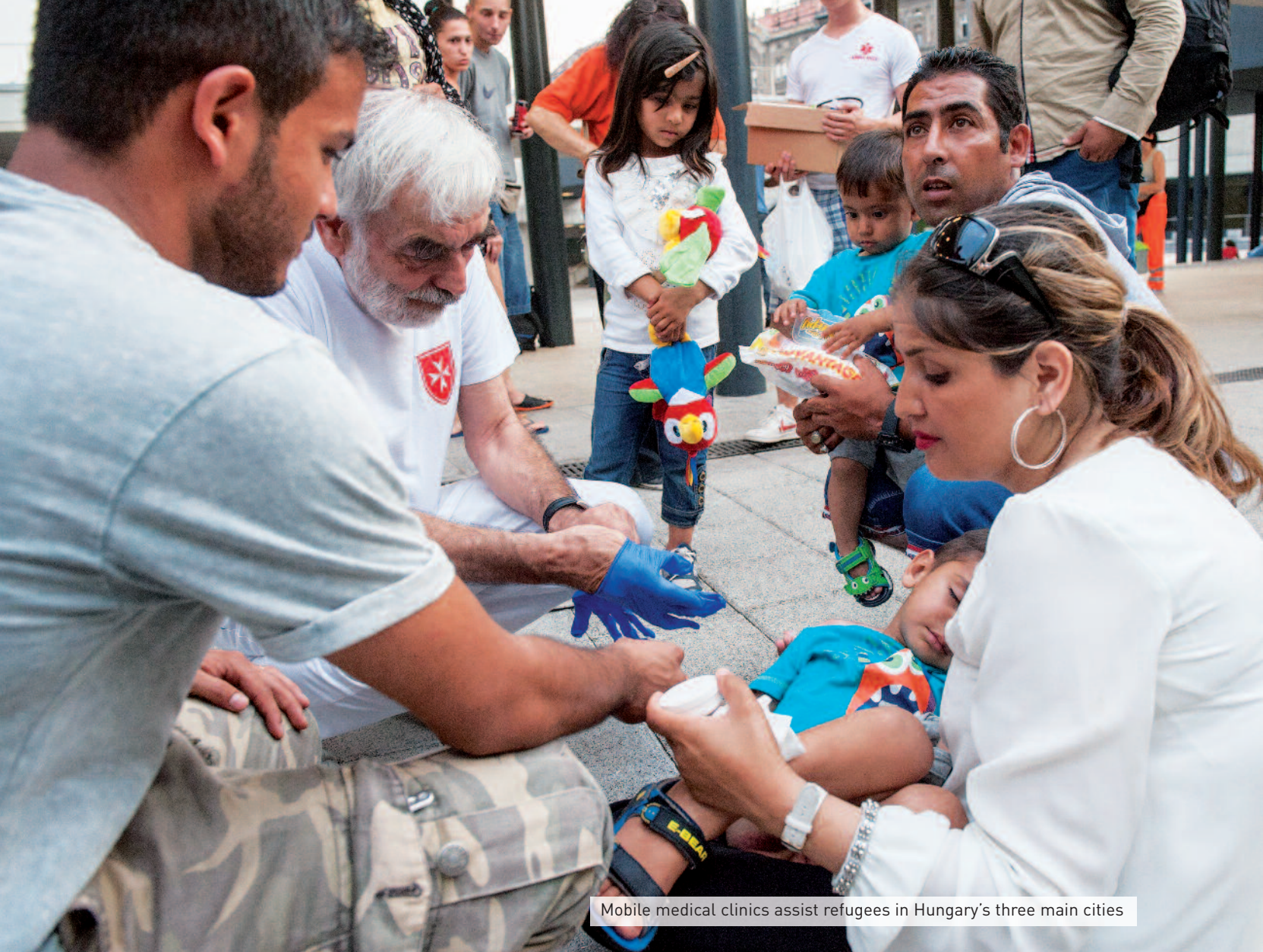
Mobile medical clinics assist refugees in Hungary's three main cities