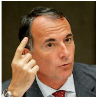
Former Italian Minister of Foreign Affairs, President of SIOI FRANCO FRATTINI