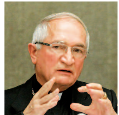
Permanent Observer of the Holy See to the UN in Geneva ARCHBISHOP MONS. SILVANO TOMASI

Amb. Slimane Chikh is the Permanent Representative of the Organisation of Islamic Cooperation to the UNOG. He served as ambassador of Algeria to Egypt and permanent delegate to the League of Arab States. He was a member of the National Council, Minister of National Education, Minister of Culture, Counsellor to the presidency of Algeria.